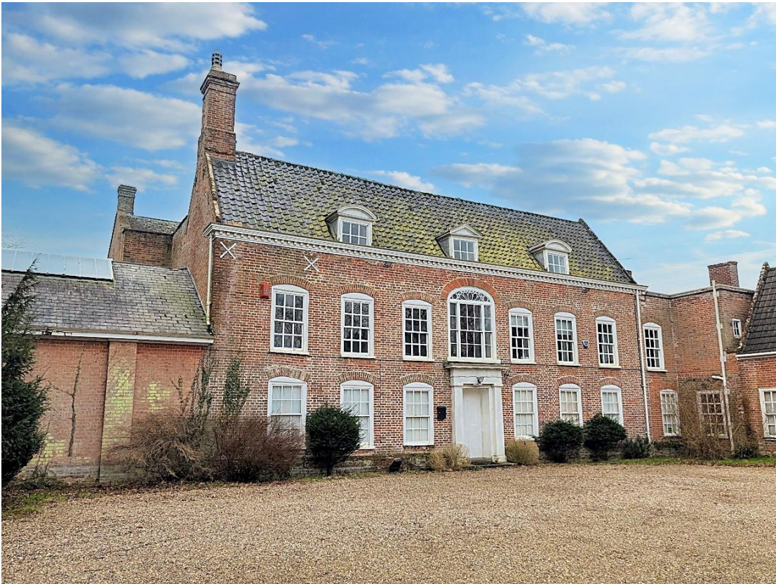
For sale on behalf of the Liquidators

Former Care Home with Two Adjoining Cottages 780.32m 2 (8,398sqft) 3.35 Hectares (8.28 Acres)