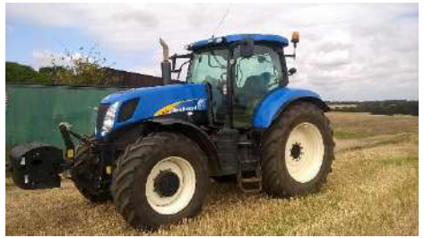
LOTS: 503 & 504