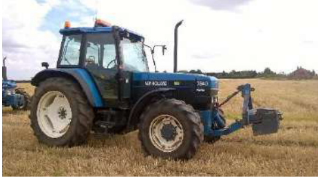
LOT: 505 & 506