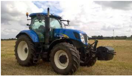
LOTS: 503 & 504